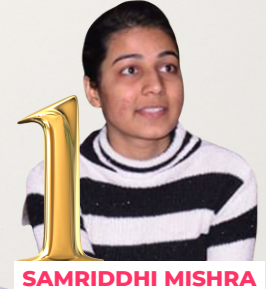
CLAT PG 2022 - ALL INDIA RANK 1